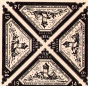
ILLUSTRATION \frac{3}{4} ACTUAL SIZE