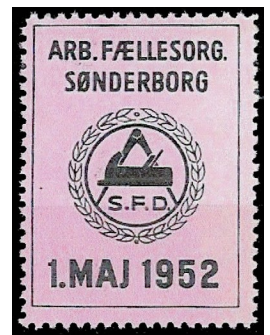
1952 - Second-generation scan of original stamp.

1949 - DSF - Dansk Skrædderforbund (Danish Tailors' Association).