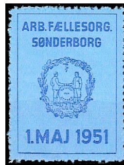
1951 - Second-generation scan of original stamp.