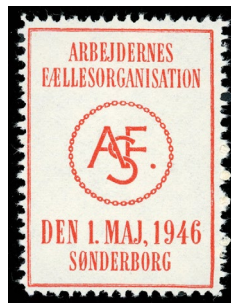
1946 - Scan of original stamp.