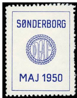
1950 - Scan of original stamp.