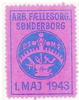
1943 - Poor quality photocopy of original stamp.