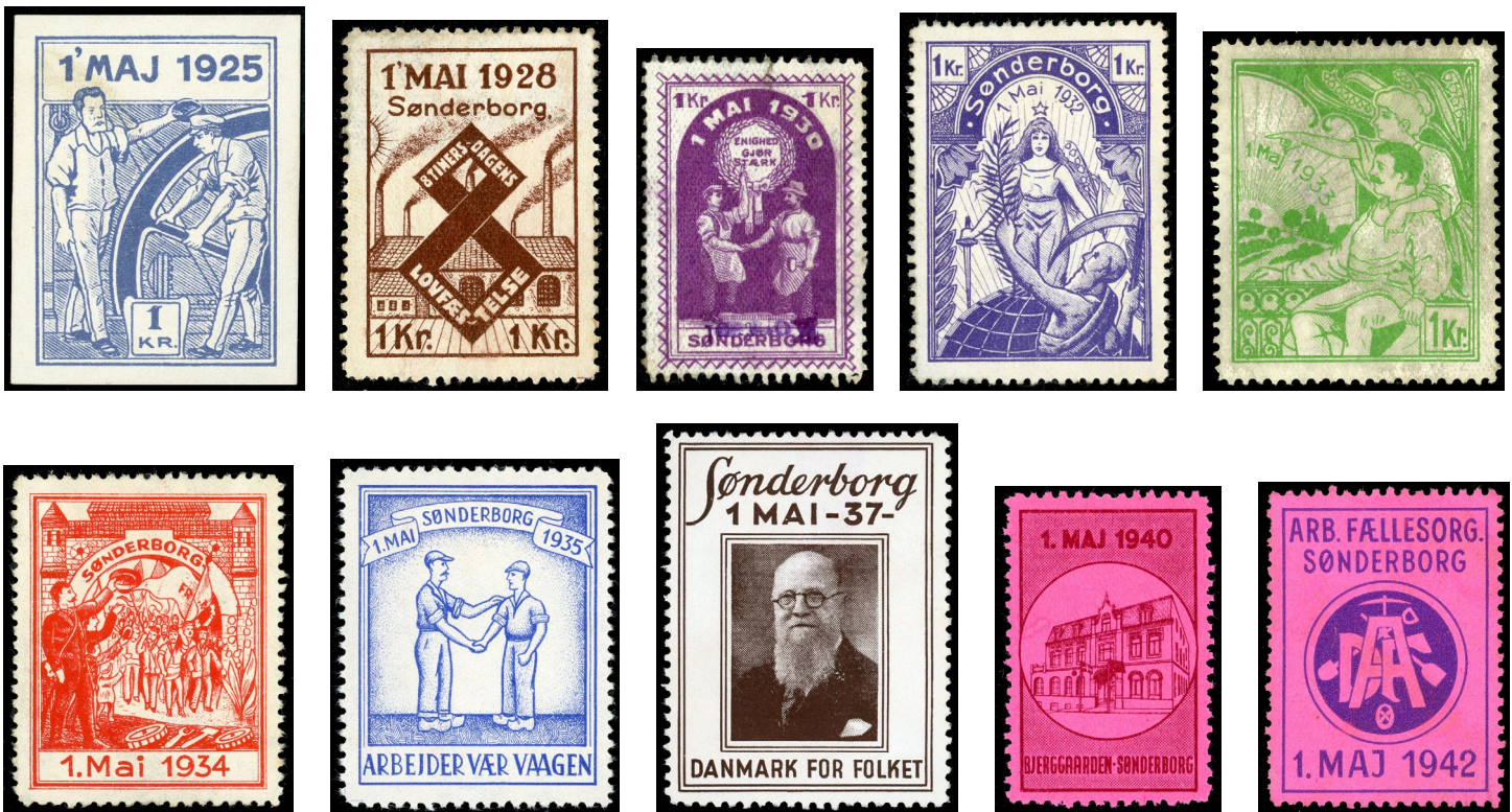
Early stamps in the series use generic images related to "labor" or workers. The 1937 stamp depicts Prime Minister Th. Stauning. From 1942 on stamps depict logos of various affiliated trade unions.

The Sønderborg stamps are quite rare now, and a 1956 letter from the Arbejdernes Fællesorganisation for Sønderborg og omegn (Workers' Joint Organization for Sønderborg and surrounding area) suggests that there were no stamps issued for the years 1930, 1941, 1944, and 1945. But there is, in fact, a stamp from 1930, and others may exist as well.