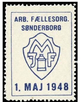
1948 - Scan of original stamp.

Beginning in 1942 the logos of the various trade organizations were shown. At each festival the organizations would traditionally display banners with their logos.