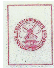
Presumed to be 1947 - Poor quality photocopy of original stamp.