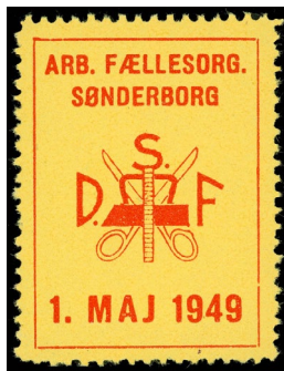
1949 - Scan of original stamp.