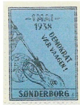
1938 - Poor quality photocopy of original stamp.