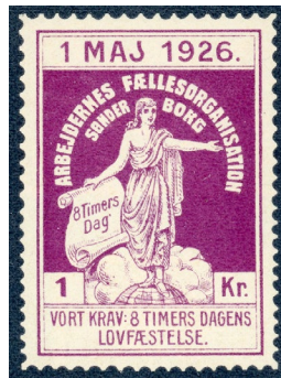
1926 - This image was taken from I.P. Jensen's catalog.