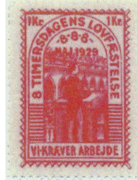
1929 - Poor quality photocopy of original stamp.