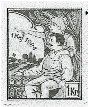
1924 - The same image was re-used in 1933

Here are some of the stamps missing from the previous page, as well as a continuation of the series. Some of these are only available right now as scans of poor quality photocopies.