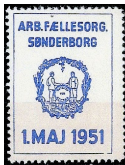
1951 - Second-generation scan of original stamp.