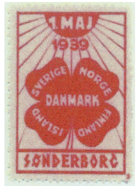
1939 - Poor quality photocopy of original stamp.