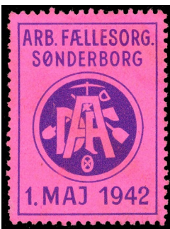
1942 - Scan of original stamp.