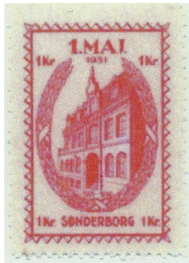
1931 - Poor quality photocopy of original stamp.