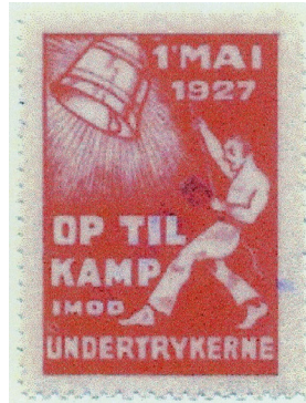
1927 - Poor quality photocopy of original stamp.