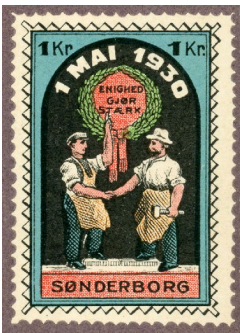
1930 - Image from I.P. Jensen's advertising folder.