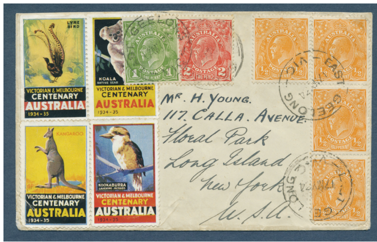
Four stamps of set #4, mailed from East Geelong (Victoria state) to New York state, 17 May 1934, with 5 pence postage.