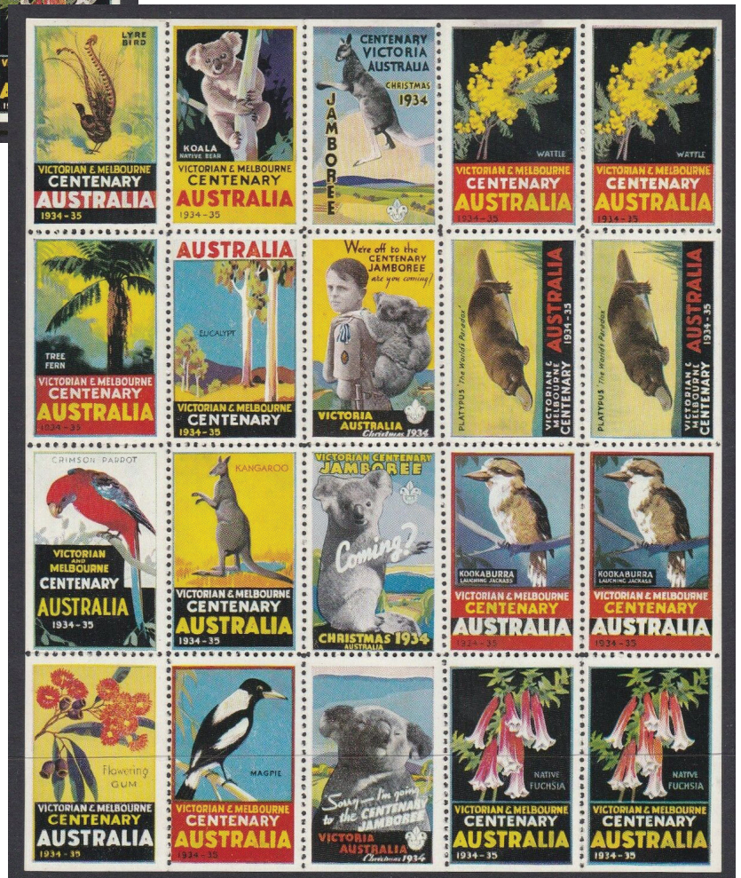
3. Variation of above: Four Scouting jamboree stamps are inserted in the pane, and only 4 stamps are doubled.