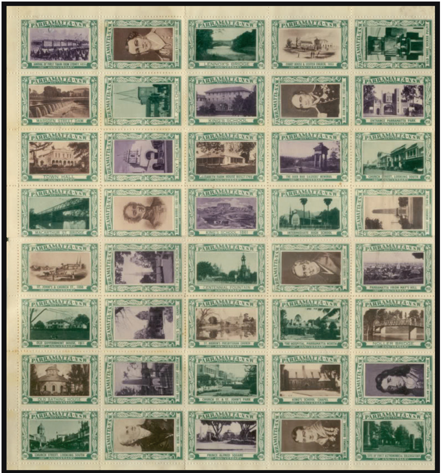
The pane of #13.

13. Sheet of 40 designs (5x8), similar to above, frame is green, text: 'PARRAMATTA-N.S.W./ Australia 1788/1838'; similar to set 11 & 12, varied photographs tinted green, brown or violet; No marginal text. Parramatta is a city near Sydney (now a suburb) founded a few months after Sydney in 1788, so it could justify its own issue. This sheet is apparently more scarce than the other two.