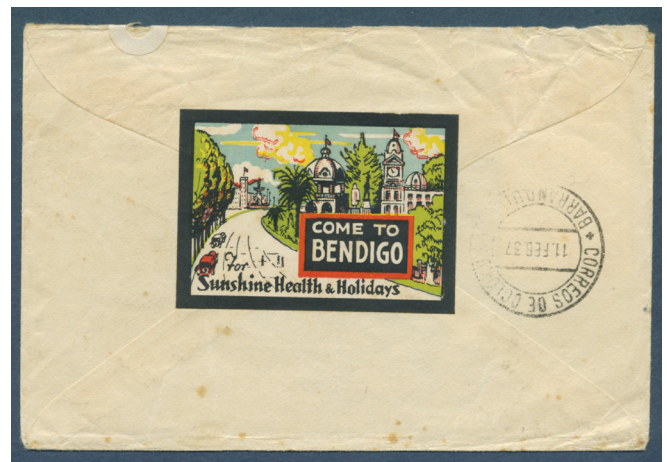
Back of the cover on the right, boosterism: Bendigo is a town in the center of Victoria State. The receiving cancel is dated February 11, 1937, so the Centenary stamp on the front is 2 years out-of-date.