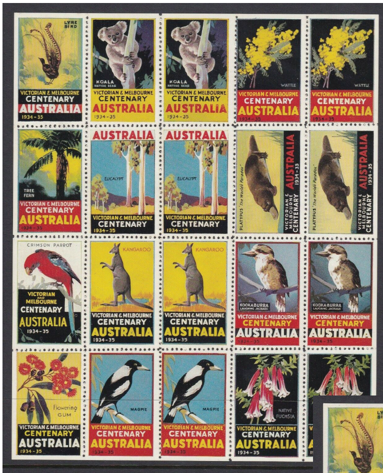
The original layout for item #2.