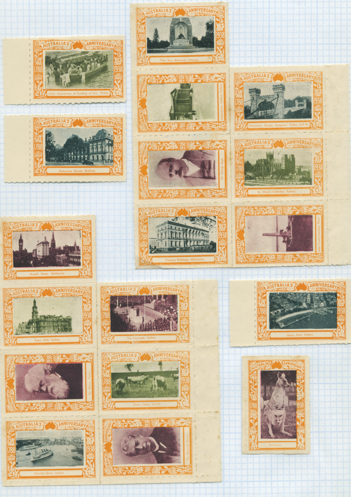
2 Varieties: the author has seen scans online which show all photos tinted red violet.